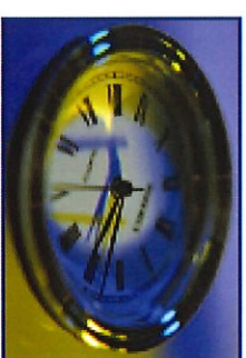
Maybe it's time to get help